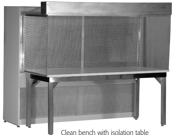
Clean bench with isolation table