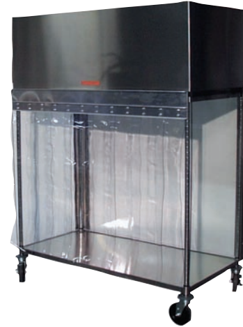
Table Top Model